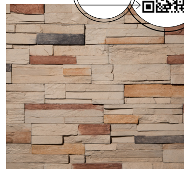
Ponderosa Stacked Stone

Predictable shapes, grout-free installation and the convenience of panels, Stacked Stone is a DIYer's dream. Visually Stacked Stone features stones ranging from ½" to 3" high, giving the appearance of multiple layers of cut stone.