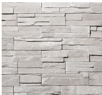
Glacier Stacked Stone