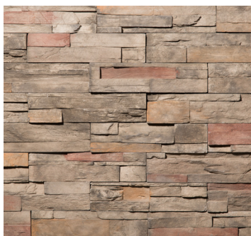
Riviera Stacked Stone