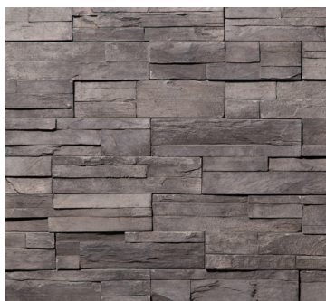
Del Norte Stacked Stone