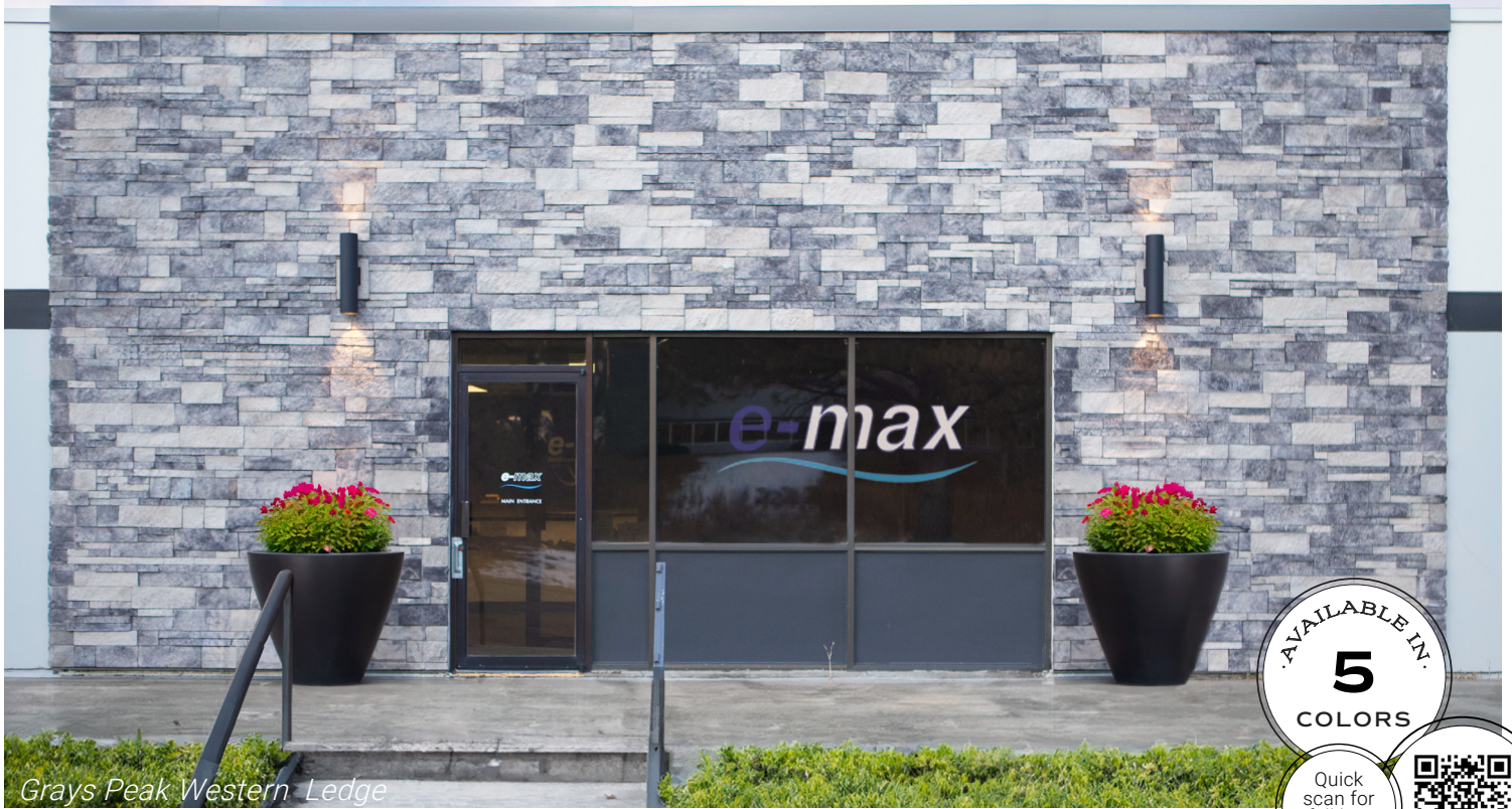
Grays Peak Western Ledge