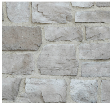
Winter Sky Cobble