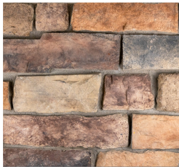
Blue Spruce Cobble