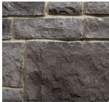
Black Rundle Limestone