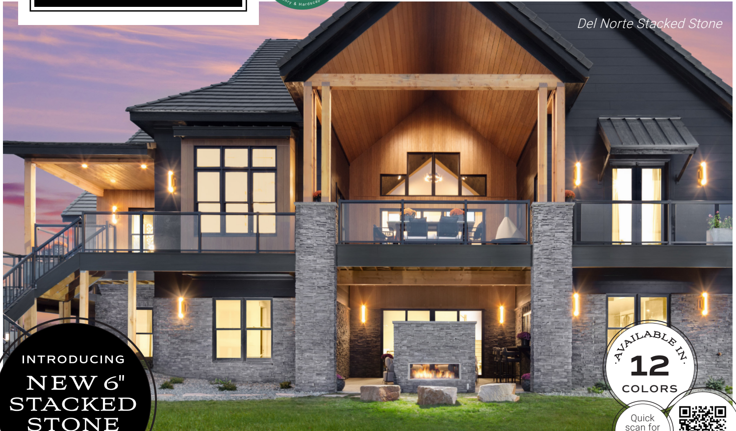
Del Norte Stacked Stone