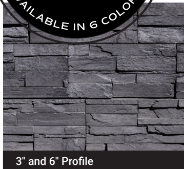
3" and 6" Profile