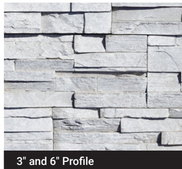
3" and 6" Profile