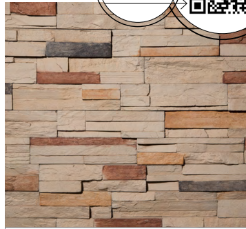
Ponderosa Stacked Stone

Predictable shapes, grout-free installation and the convenience of panels, Stacked Stone is a DIYer's dream. Visually Stacked Stone features stones ranging from ½" to 3" high, giving the appearance of multiple layers of cut stone.