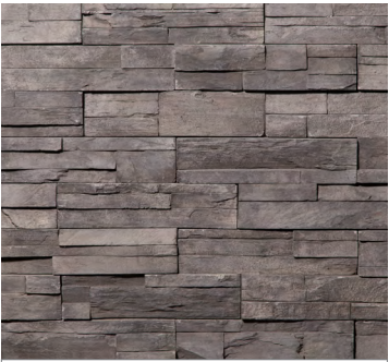
Del Norte Stacked Stone