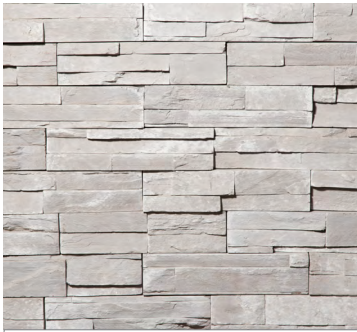
Glacier Stacked Stone