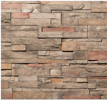
Riviera Stacked Stone