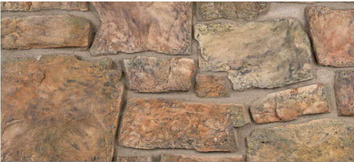
Sienna Moss Ledge