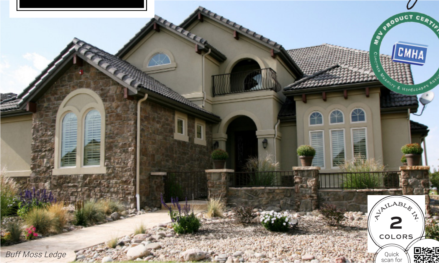
Buff Moss Ledge