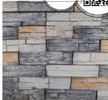
Castle Peak Stacked Stone

Predictable shapes, grout-free installation and the convenience of panels, Stacked Stone is a DIYer's dream. Visually Stacked Stone features stones ranging from ½" to 3" high, giving the appearance of multiple layers of cut stone.