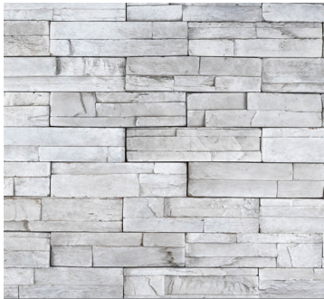
Glacier Stacked Stone