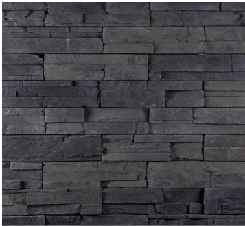
Del Norte Stacked Stone