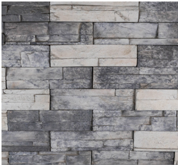
Gray's Peak Stacked Stone