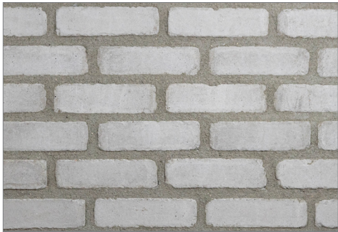
Fog Thin Brick