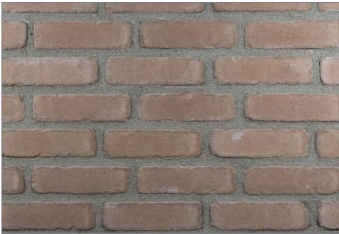
Dust Devil Thin Brick