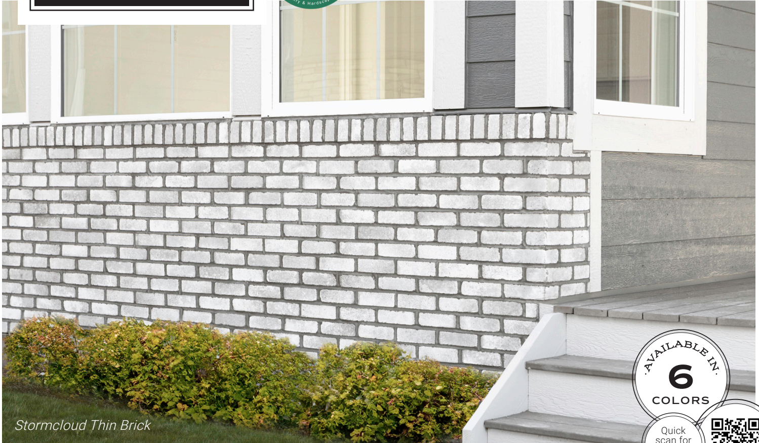
Stormcloud Thin Brick